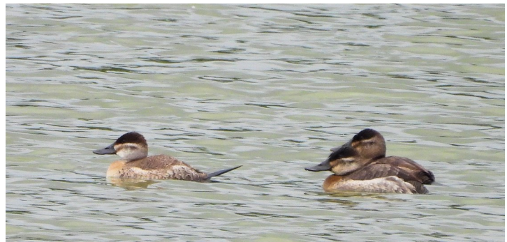
Ruddy Ducks.

tance, time, and some growling stomachs took the fight out of our plans for a second walk in the surrounding grasslands to look for uncommon sparrow migrants. Other birders’ checklists from that weekend verified it was a good decision to skip the sparrows for breakfast, which six of us enjoyed together to off a good morning.