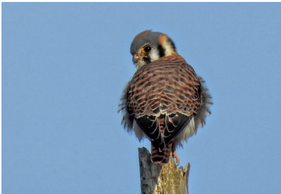
American Kestrel.

https://birdinghotspots.org/hotspot/L4168725