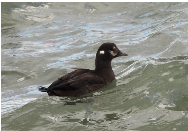
Harlequin Duck.

Sixteen members and friends of the Kirtland Bird Club attended the November 11, 2023, field trip. Cloudy conditions brightened to sunny skies, but a north wind chilled everyone. We visited three lakefront locations, starting at the Perkins Overlook at Edgewater Park. Ten species were seen there, including a Bald Eagle and two White-winged Scoters in a raft of five duck species. After a stop at the Edgewater fishing pier to view Harlequin Duck, we continued to the east end of the Edgewater Yacht Club Marina. We added seven species there. The last stop was at Wendy Park on Whiskey Island. The group took a short walk near the mouth of the Cuyahoga River and brought the morning's final tally to twenty-four species. Finally, nine folks enjoyed a hearty lunch at a nearby Irish pub, The Harp.