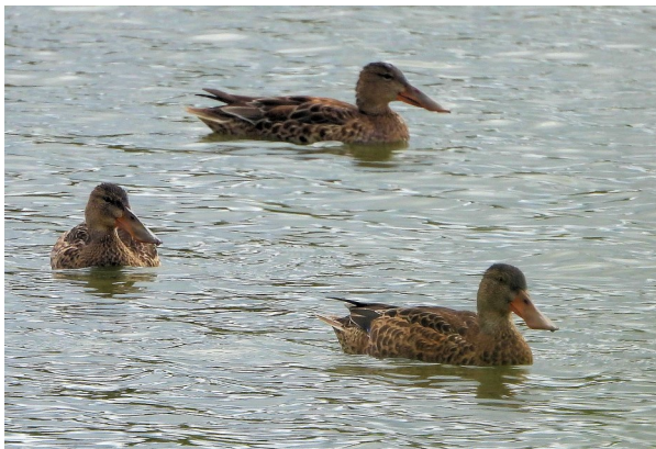
Northern Shovelers.

The 2-mile walk was in mostly mild weather that included brief periods of light rain with equal bouts of sunshine. Our group numbered around 12 members and guests, aged from a young teen to the usual spry seniors. The dis-