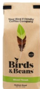
Wood Thrush, Medium Roast