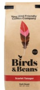
Scarlet Tanager, French Roast