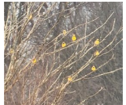
Eastern Meadowlark by Matt Valencic

trip list. Finally, on Hayes Road, we found a few horned larks at the edge of a manure spread, where there were over 100 larks the day before the field trip! (Matt said, "What a difference a day makes!") A Northern Harrier was added here, too. Multiple Eastern Bluebirds were found on Patch and Hayes Roads.