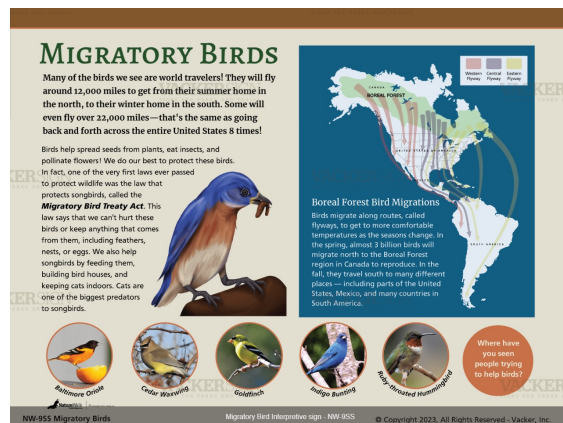
Signage proposed for Sims Park