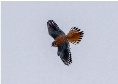
American Kestrel

The Kirtland Bird Club's annual winter field trip to Geauga County was on Saturday, January 6, 2024. It was an overcast morning, with temperatures hovering between 25°F and 32°F and light snow at the end. We started with 23 people at LaDue Reservoir, but that number dwindled to 7 by the last leg on Hayes Road. Besides finding our target birds, everyone enjoyed the two stops at Parkman's Market Express gas station and convenience store to warm up, use the clean restrooms, and have pizza for lunch.