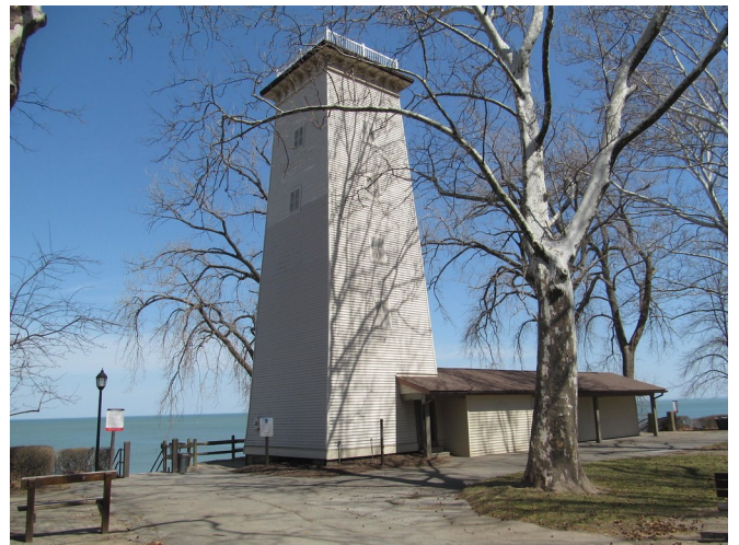
Water Tower at Huntington Reservation

This 102-acre Cleveland Metroparks site includes nearly a half-mile of Lake Erie shoreline, most of which is sand beach. Five break walls extend up to 350 feet into Lake Erie and serve to protect the beach from erosion. A steep bluff overlooks the beach and lake and provides a good lake-watch vista. From the Water Tower location, we'll scan for waterfowl. Also, if there's time before the program begins at 1 PM, we'll take a short walk in the Wolf Picnic Area to look for Barred Owl.