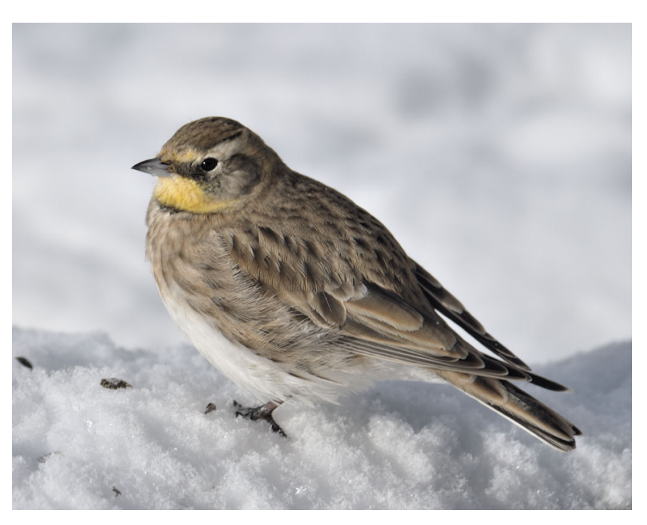
Female Horned Lark, North Chagrin Reservation, 1-9-2010