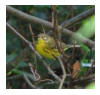
Prairie Warbler, Villa Angela State Park, 9/27/2009