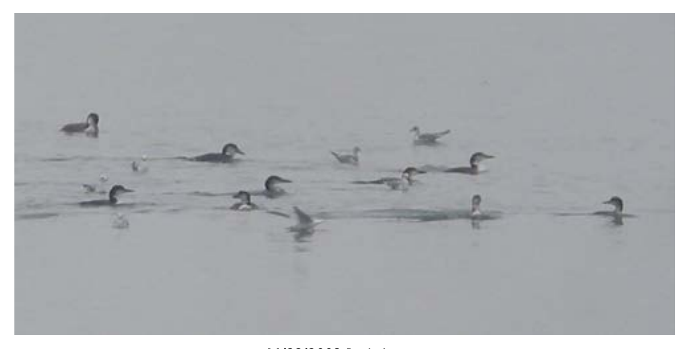
11/22/2009 Paula Lozano

Common Loon. Earliest reports came from HBSP with one on 10/12; peak numbers there totaled 25 on 10/16, 25 on 11/4 and a high of 106 on 11/12 (RH). As expected most occurrences fell mid-November onwards. At least fifty had been counted on 11/19 at Rocky River Park (PL, RF, AS) and as many as 91 again on 11/24 (PL);