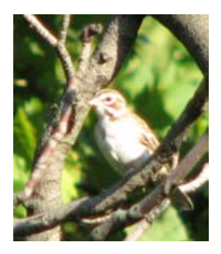
Lark Sparrow, Villa Angela State Park, 9/5/2009