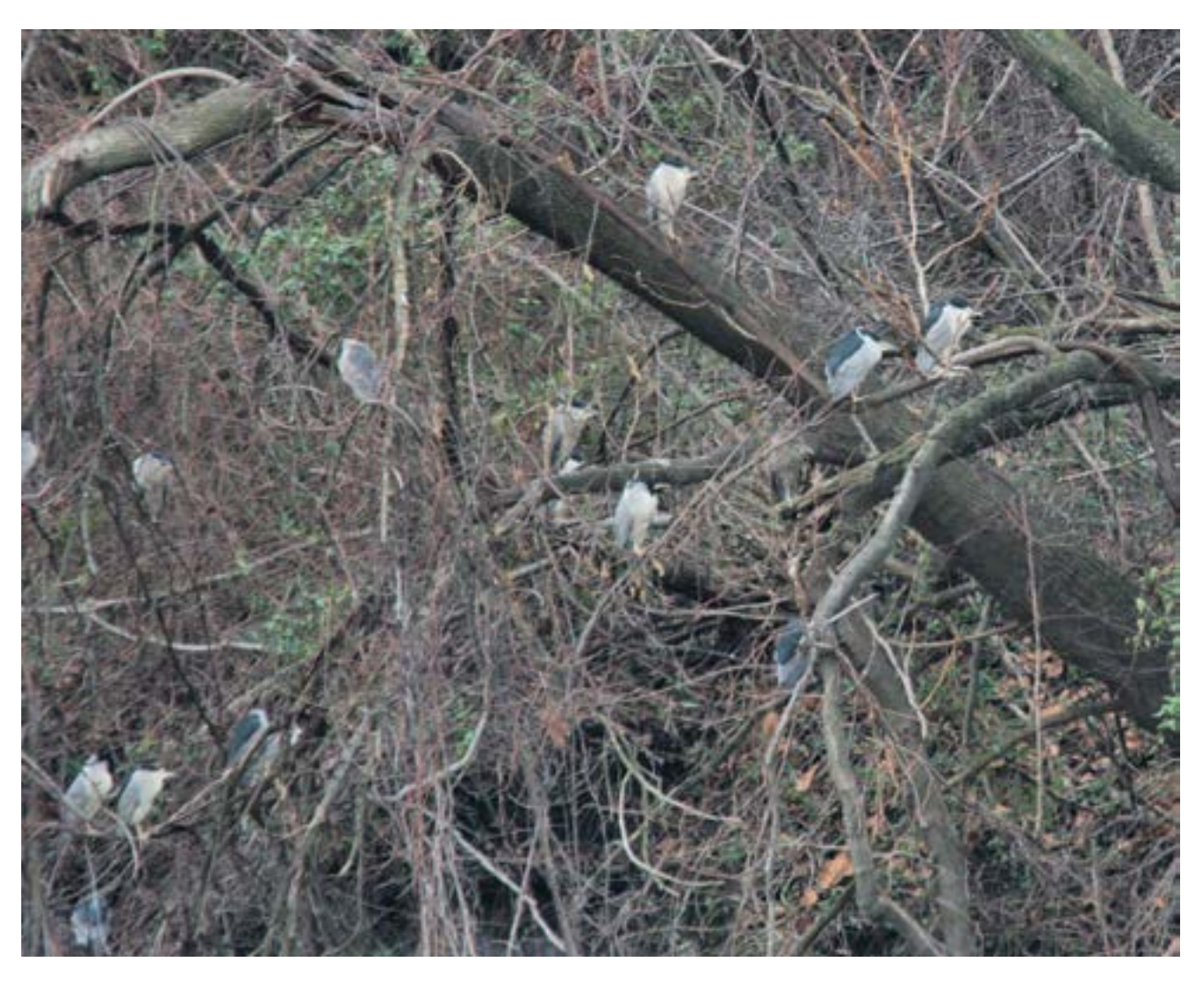
Black-crowned Night-Heron, Cleveland, 1/13/2008