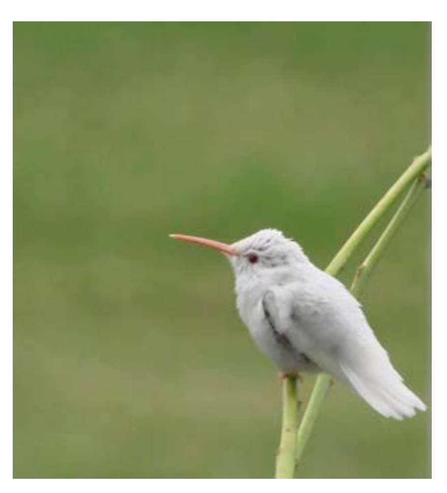
Albino Ruby-throated Hummingbird, Bainbridge, 9/7/2009 Linda Gilbert

Hairy Woodpecker. On 9/10 there were two at Station Road (DAC). A five hour morning hike in the CVNP