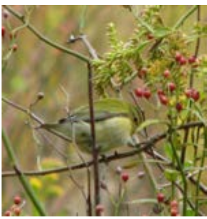
Tennessee Warbler, Villa Angela State Park, I 0/24/2009