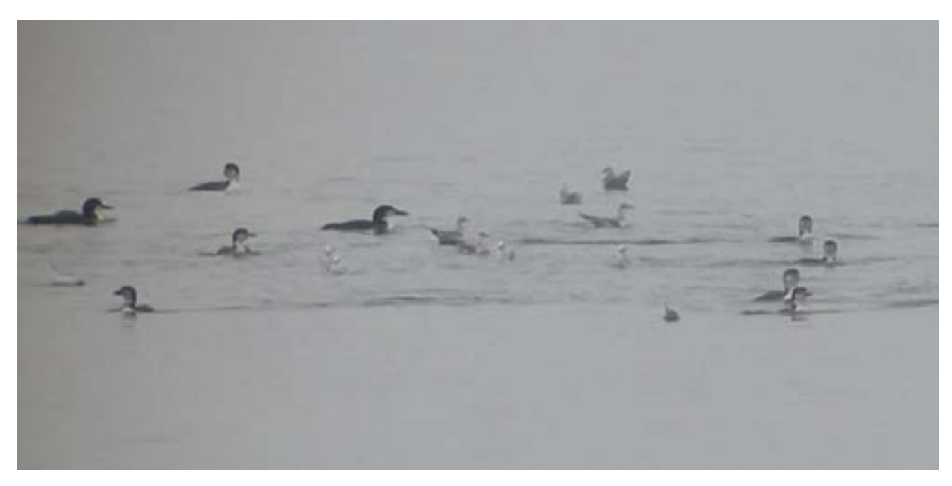
Loons and Gulls, Rocky River City Park (continued opposite)

Harlequin Duck. Single birds were observed from the Headlands Road lookout on 11/1, 11/3 and 11/5 (JT fide RH).