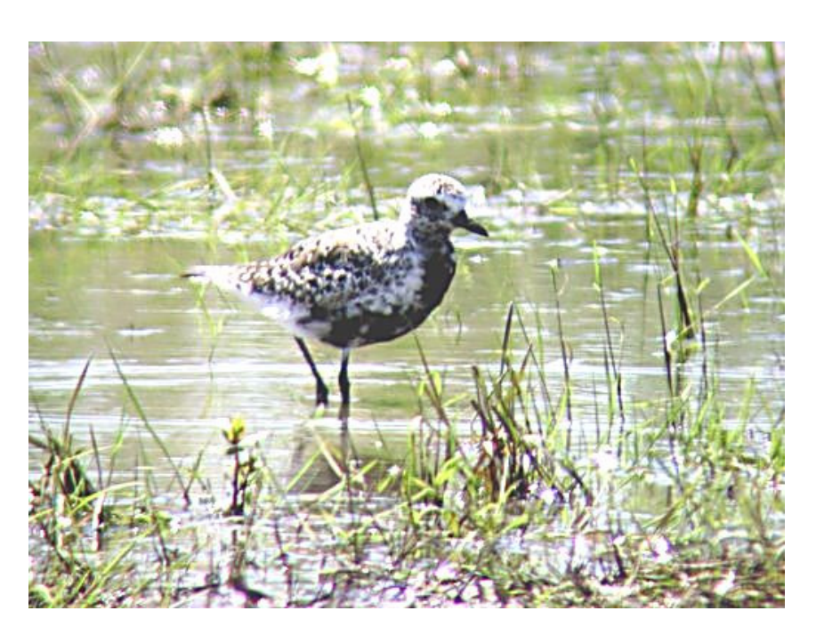
Black-bellied Plover, Lorain Harbor Impoundment, 5/18/2009 Greg Bennett

1 on 3/14 at Rocky River Park (Cuyahoga Co.) (GL).