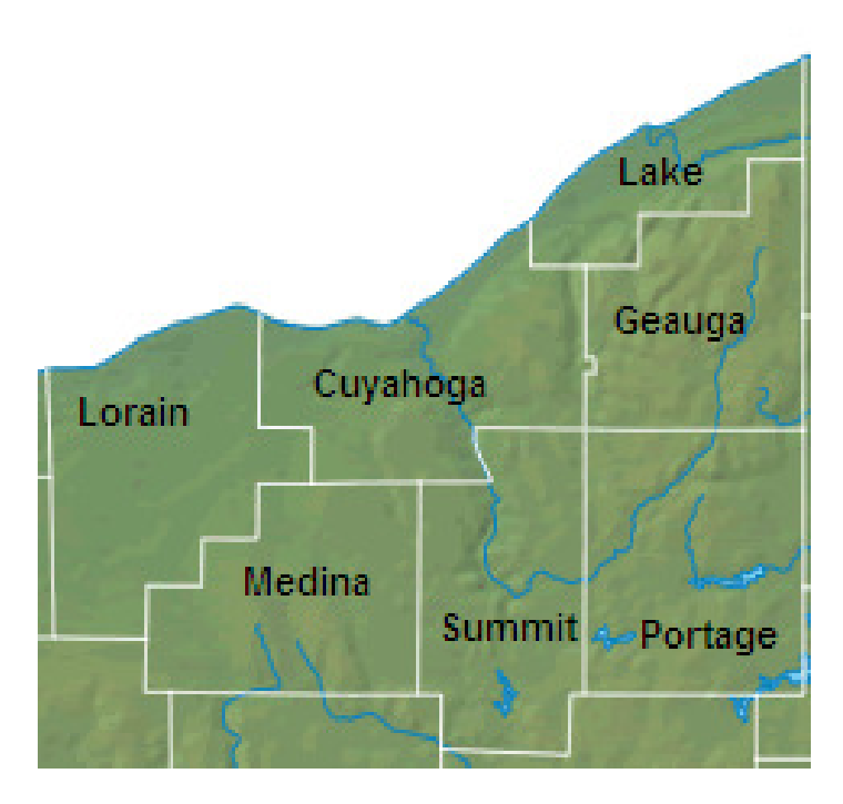
Cleveland Bird Calendar 7-county Area

Some submissions are received indirectly through forwarded correspondence (fide = "in trust of").