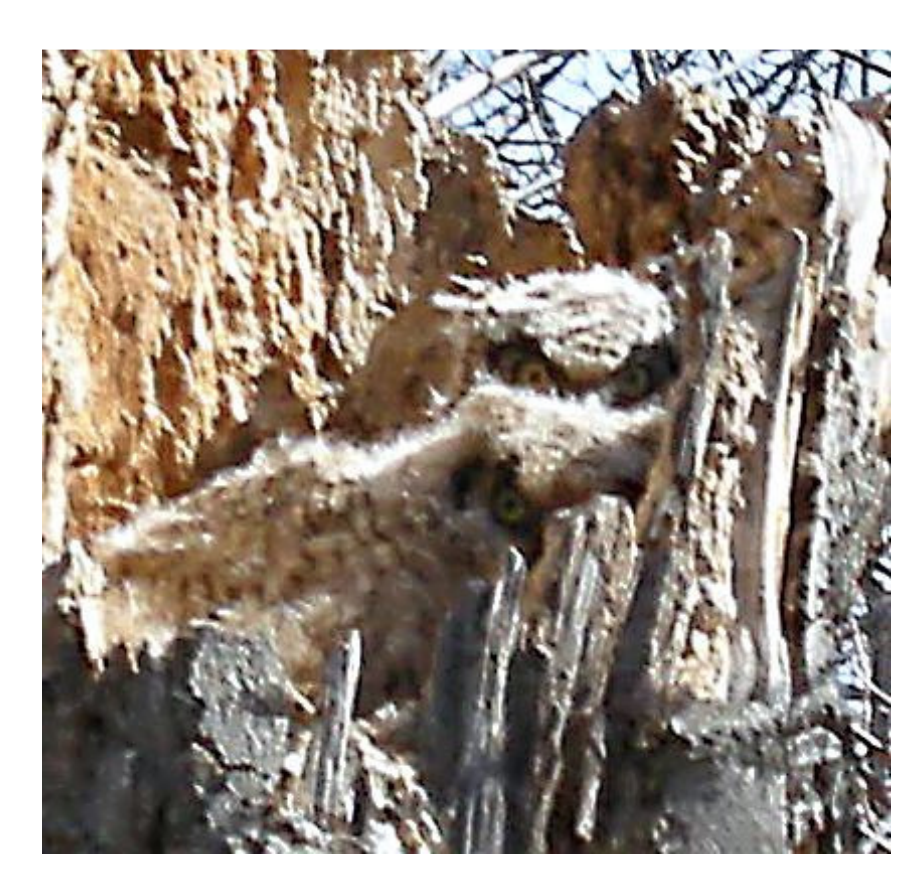
Two Great Horned Owl Nestlings, Elmwood Park, Lorain, 4/12/2009