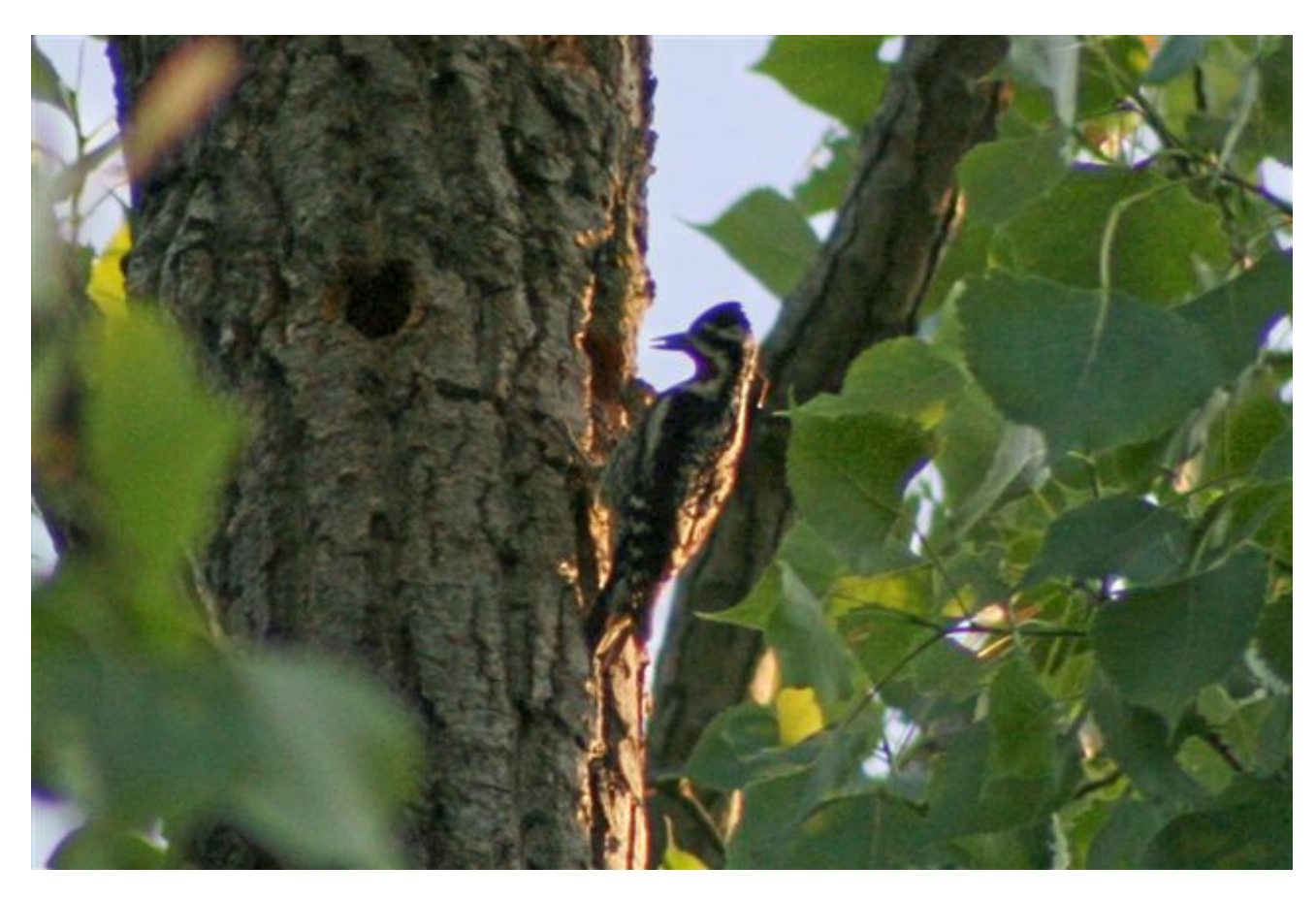
Yellow-bellied Sapsucker, Headwaters Park, Geauga County, 5/21/2009 Christy Blair

Red-headed Woodpecker. From 4/28 onwards, HBSP had nearly daily sightings with as many as six on 5/7 (RH). On 5/21 two were discovered at a nest in the CVNP's Boston area