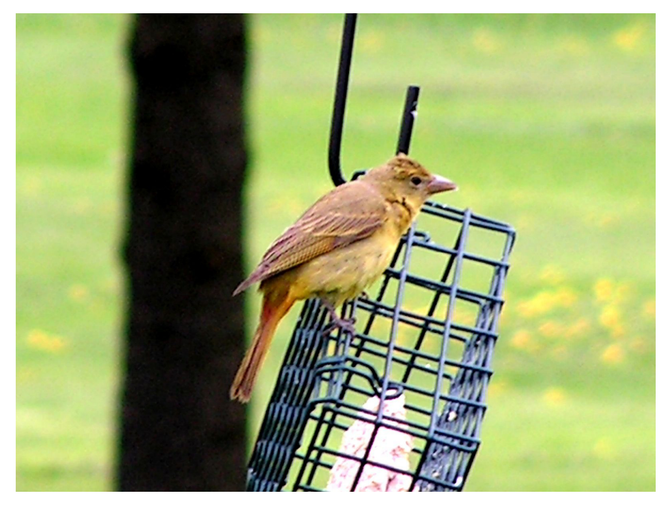
Female Summer Tanager, Hambden Township, Geauga County, 4/29/2009 – 5/1/2009

66 on 4/5 at Mentor Marsh (LR). 23 on 4/5 along W. branch of the