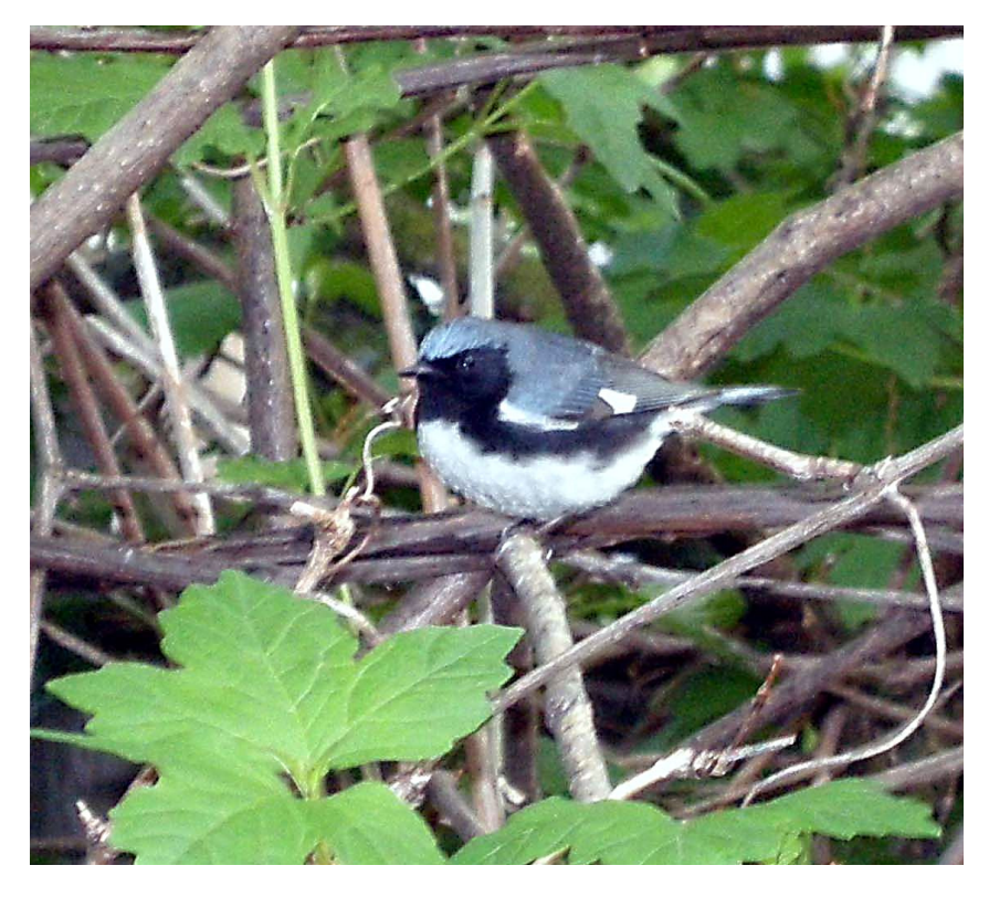
Black-throated Blue Warbler, Lakewood, 5/16/2009 Paula Lozano

record set in 1955 (JP). Single birds were seen at West Creek Reservation in Parma on 5/10 (GL) and on 5/12 at Cleveland Lakefront SP (TMR).