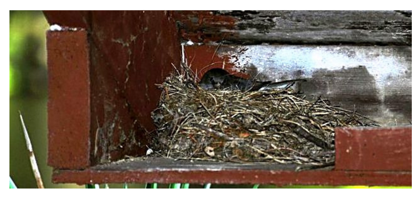
Junco at Nest, South Russell, Geauga County, 5/14/2009