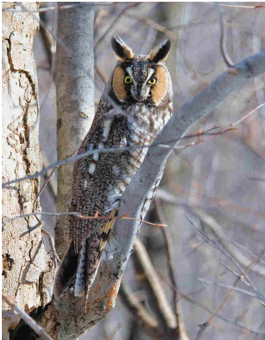
Long-eared Owl, A. B. Williams Woods, Cuyahoga Co., 12/21/2007