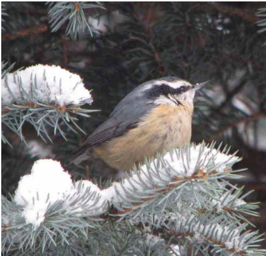
Red-breasted Nuthatch, Chardon, 2/11/2008