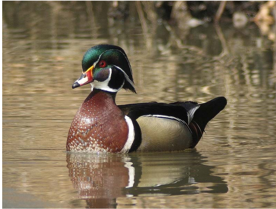
Wood Duck, North Chagrin, 3/13/2007

Bufflehead. Greg Bennett had a productive Bufflehead day on 4/21 with high counts all over Summit County and the surrounding area: 209 at Nimisila Reservoir, 193 at Mogadore, 108 at Turkeyfoot Lake, 101 at Long Lake, 105 at Springfield Lake, and double-digit counts at four other locations (GBe). Bradstreet Landing had 95 on 4/21 (BF, PL).