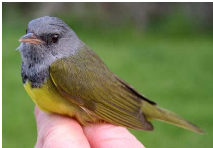
Yellow-breasted Chat and Mourning Warbler, Mentor Lagoons, 5/17/07