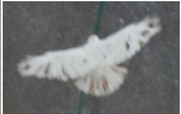
Albino Red-tailed Hawk, PPG Industries property in Barberton, 2/26/07 and 2/27/07 Steve Hughes