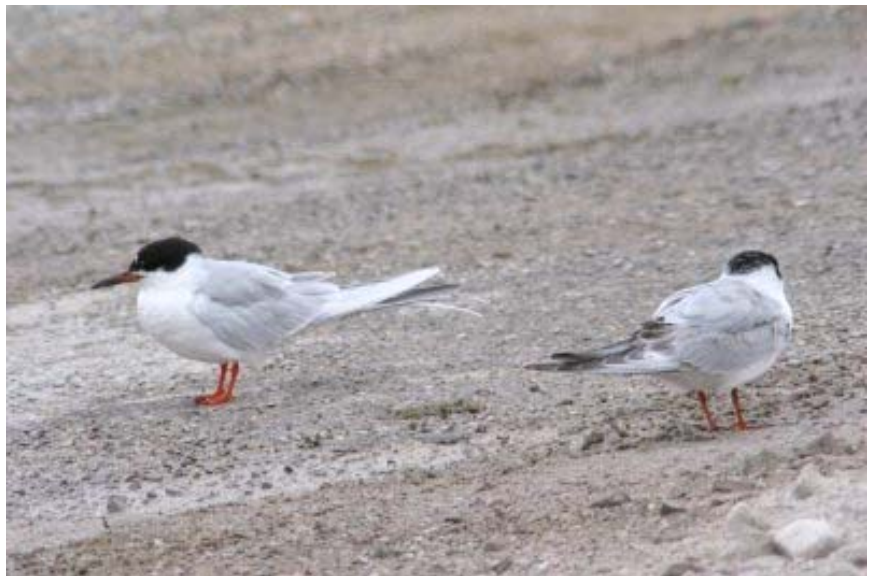
Forster's Terns, Mentor Lagoons, 4/9/2007

Hybrid Herring x Great Black-backed Gull. Two birds, a second-year and an adult, were seen at Lorain Harbor on 3/17 (JP).