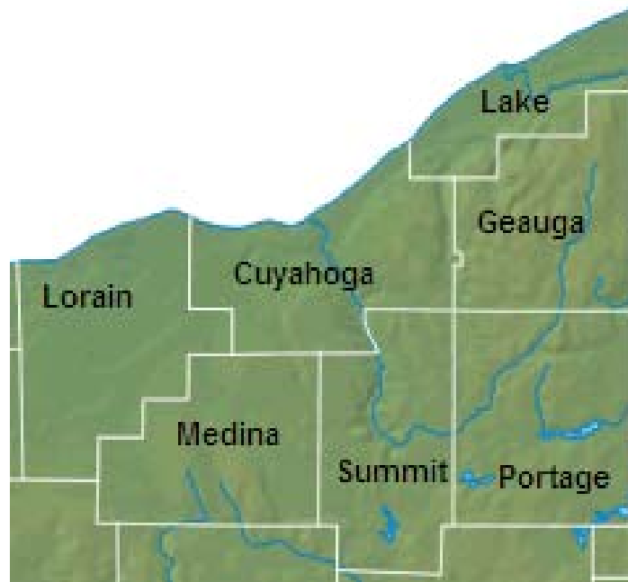
Cleveland Bird Calendar 7-county Area

Note: Some submissions are received indirectly through forwarded correspondence (fide = "in trust of").