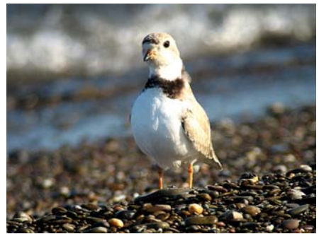
Piping Plover, HBSP, 5/1/2007 Jerry Talkington

Semipalmated Plover. Seven were seen at Crook Street wetlands (Lorain County Metro Parks) on 5/19 (GL). HBSP hosted two on 5/16 (RH).