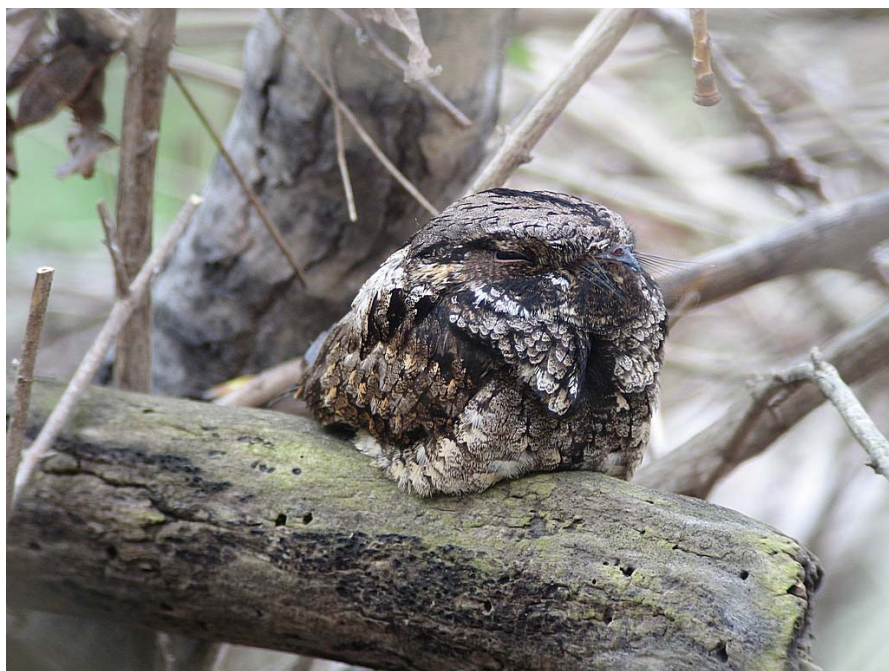
Whip-poor-will, HBSP, 4/27/07 Jerry Talkington

Eastern Screech-Owl. Two were found at HBSP on 4/21 (RH). One was seen in a nest cavity at Station Road on 3/29, 4/1, and 4/19 (DAC).