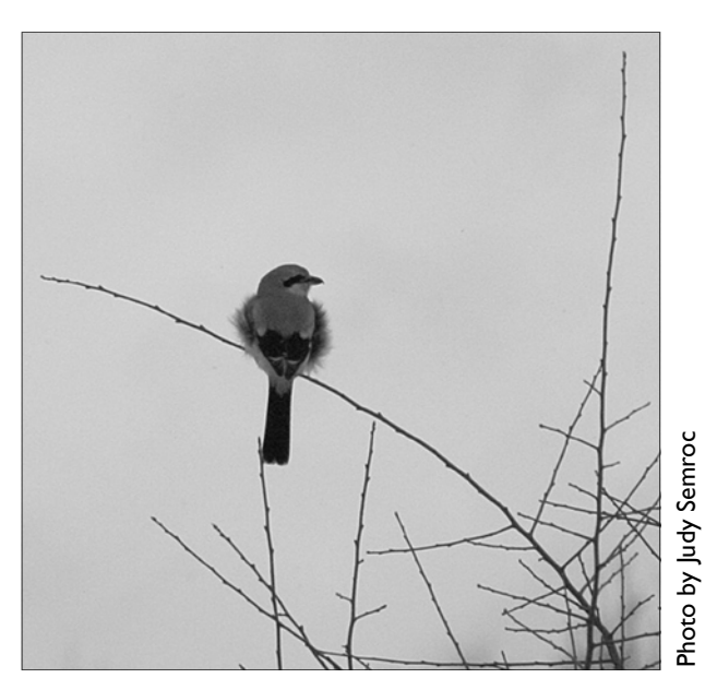
Northern Shrike Ravenna Arsenal – January 9, 2007

Yellow-bellied Sapsucker. One was at the Rocky River Nature Center's feeders on January 21 (BD). Three were at the CVNP Ira Road marsh on both December 11 and January 22 (TMR). One was in a Richmond Heights backyard on February 5 (NA). One visited an Akron feeder February 11 and 12 (AS).