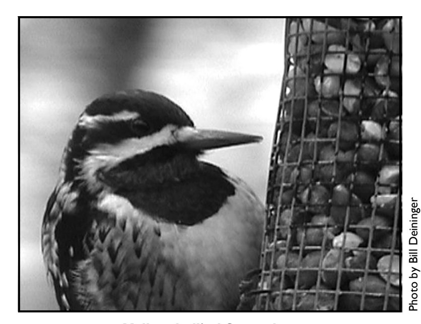
Yellow-bellied Sapsucker Rocky River Nature Center – January 21, 2007

Yellow-bellied Sapsucker. One was at the Rocky River Nature Center's feeders on January 21 (BD). Three were at the CVNP Ira Road marsh on both December 11 and January 22 (TMR). One was in a Richmond Heights backyard on February 5 (NA). One visited an Akron feeder February 11 and 12 (AS).