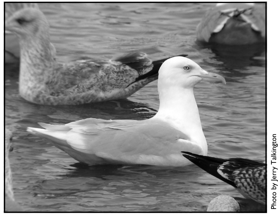
Adult Glaucous Gull Lake Erie at East 72<sup>nd</sup> Street, Cleveland – date unrecorded

Lesser Black-backed Gull. Fourteen reports, all January and February, from the usual spots along the lake (E. 72<sup>nd</sup> Street, Fairport Harbor, HBSP, Lakeshore Reservation). The sightings consisted of mostly one or two birds and, when aged, split between either adult or first-winter. Three, two adults and one firstwinter, were seen at Eastlake Power Plant on January 1 (JP). Six were seen at E. 72<sup>nd</sup> Street February 10 (JB). Two adults and one firstwinter were seen at E. 55<sup>th</sup> Street on January 27 (GL). On February 4, four were seen at E. 72<sup>nd</sup> Street (KM) and four on February 7 (LR).