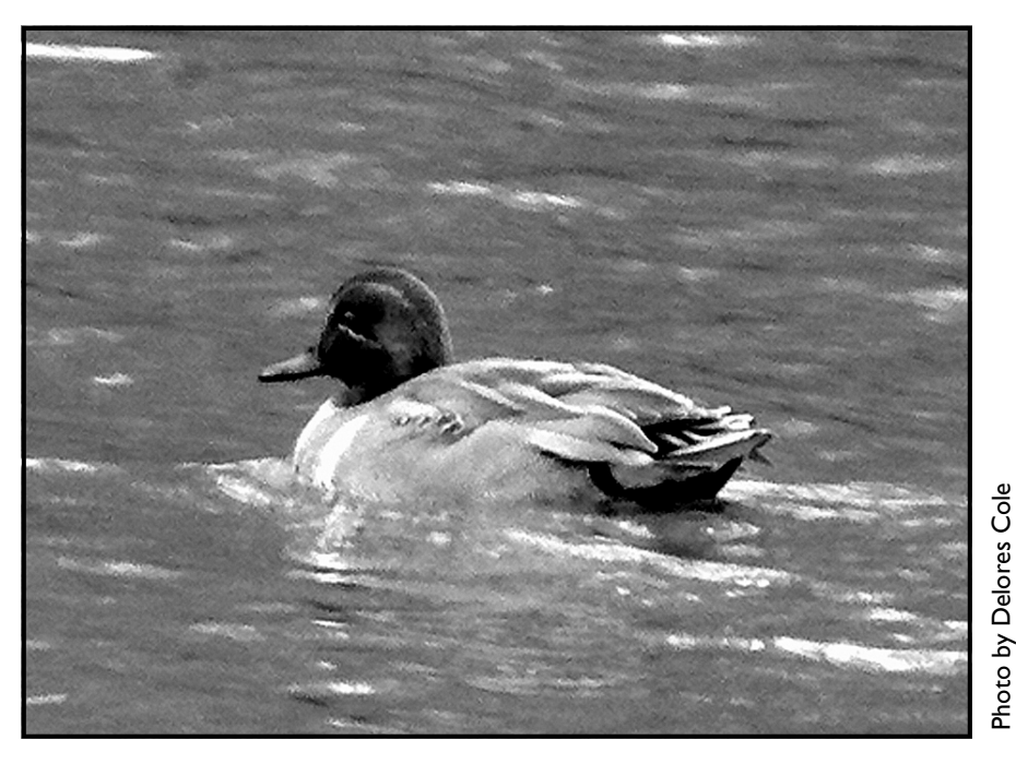
Green-winged Teal North Chagrin Reservation, Cleveland Metroparks — January 7, 2007

Green-winged Teal. One was seen at the south pond from the Nature Center at the North Chagrin Reservation on December 28 and January 12 (FL). Another was seen at Lake Pippen on February 1 (LR).