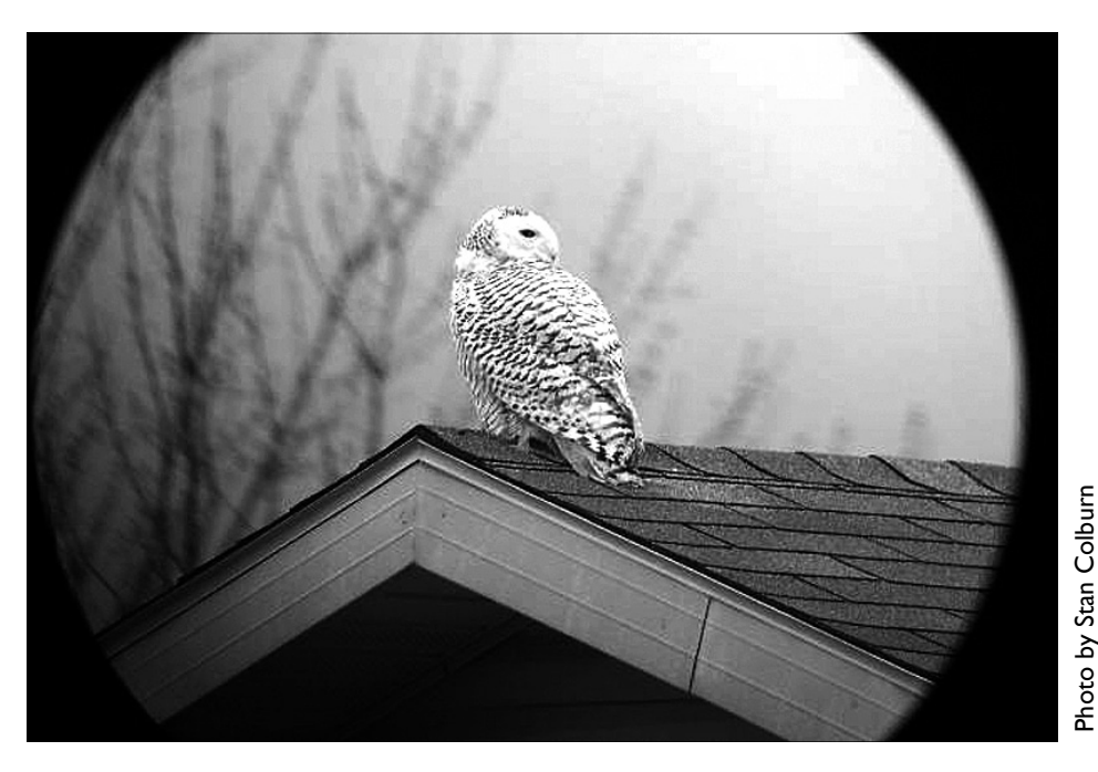
Snowy Owl West Branch Reservoir – January 1, 2007

Red-bellied Woodpecker. Five were seen at Rocky River Nature Center on December 2 (TMR). Five were at Bedford Overlook January 27 (FL).