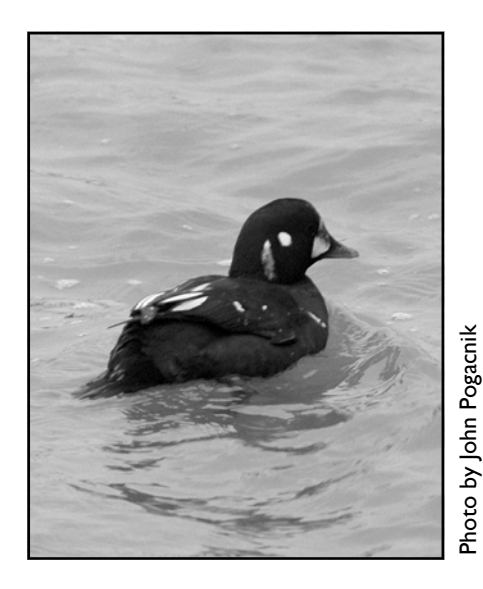
Harlequin Duck Lorain Harbor, Lorain — January 27, 2007

Black Scoter. At HBSP 40 were seen on December 2 (RH, JT, LR), with the numbers tapering off to two by December 24 (RH). Sims Park had the following well studied history: Six to seven on December 6 (NA), 10–12 on December 13 (NA), two on January 2 (CC) and one by January 27 (NA). Mentor Lagoons hosted six on December 10 (CC). Lorain Harbor had five on February 4 (GL).