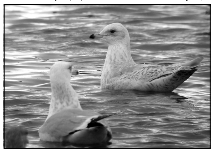
2nd Year Iceland Gull Lake Erie at East 72<sup>nd</sup> Street, Cleveland – date unrecorded

Iceland Gull. One first-year bird was at Lakeshore Reservation on January 9 and January 20 (JP). One first-year or second-year was seen at Lakeshore Reservation on February 17 (JP). One first-winter individual was at E. 72<sup>nd</sup> Street on February 10 (RH). Another was seen there on February 23 (SW).