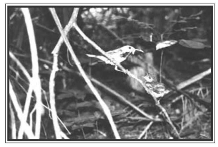
Black-throated Green Warbler and fledgling July, 1997 Hinckley by Norman J. Kotesovec , Jr.

As many as four female Blackthroated Green Warblers were found at the Hinckley Hills Road site from June 24 through August 6. A female was observed on June 24 collecting nest material, which included pine needles and spider silk. On June 28 a pair of Black-throated Greens were seen copulating upon the branch of a Black Walnut; and on July 14 an additional pair of Black-throated Green Warblers were both found in attendance to a single fledgling just days out of the nest and unable to fly. Lastly, a female was observed on August 6, foraging low in a Black Cherry, where it was attacked twice and finally driven off by a Bluewinged Warbler!