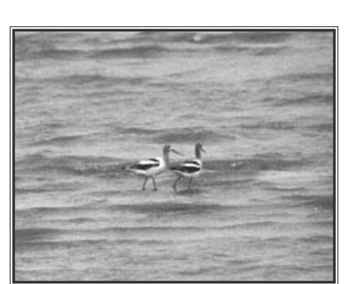
American Avocets (<u>Recurvirostra americana)</u> August 1997 Lorain