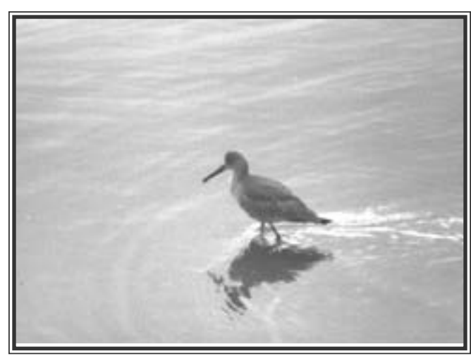
Willet (<u>Catoptrophorus semipalmatus</u>) August 17, 1997 Lorain