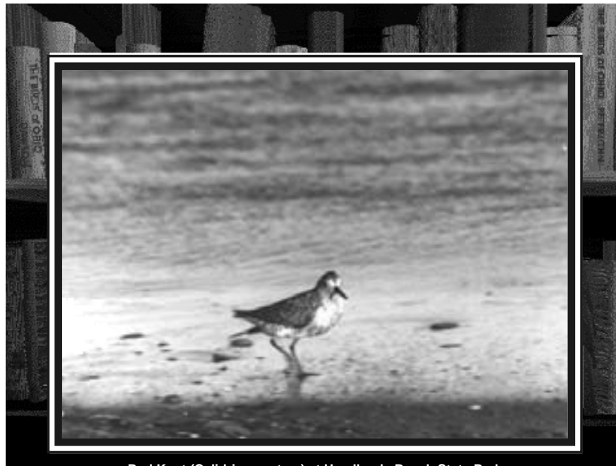
Red Knot (<u>Calidris canutus</u>) at Headlands Beach State Park