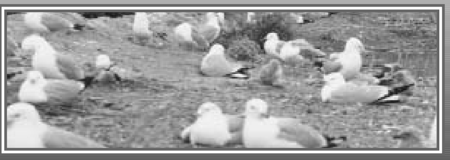
Ring-billed Gulls (<u>Larus delawarensis</u>) - at the nest and with chicks at Dock 20 - May 30, 1997.

Shorebirds received good reviews. While the numbers are not extraordinary, it was good to receive encouraging reports from along the lake and inland. An extremely early Black-bellied Plover passed by Headlands Beach State Park on Apr. 6 (EB, RH). Greater and Lesser Yellowlegs were in small numbers,