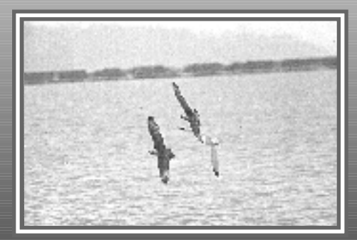
Pomarine Jaegers (<u>Stercorarius pomarinus</u>) April 1997 - Whiskey Island by Vernon Weingart

LAUGHING GULL -A breeding plumage bird with a peculiar bill was