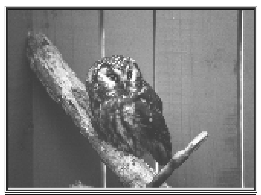
Boreal Owl (<u>Aegolius funereus</u>) - April 8, 1997 - Penitentiary Glen Rehab Center by Kevin Metcalf