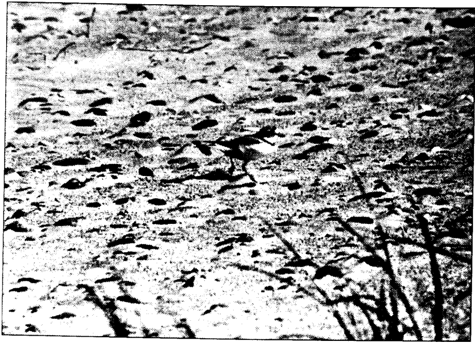
Piping Plover (Charadrilus melodus)- Lake Superior Beach. MI by Bert Szabo

TEN YEARS AGO: Three Greater White-fronted Geese were reported for the Spring 1985 season. On 5 Apr. 5 Sandhill Cranes passed by Perkins Beach (Klamm). A Red Crossbill was at Hinckley Metropark on 21-24 Apr. (Pierce, Harlan). A flock of 3 Long-billed Dowitchers was at Barberton on 27 Apr. (Rosche, Osborne). A Clay-colored Sparrow was at Donald Gray Garden on 11 May (Corbin) The first spring sighting since 1957 of Red-necked Phalarope was at Barberton on 28 May (Rosche, M.ob.).