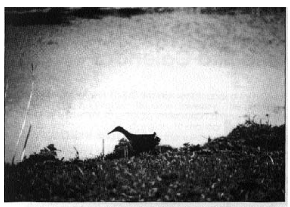
King Rail (Railus elegans) - Mages Marsh State Wildlife Area- 1994 by Melinda Greenland