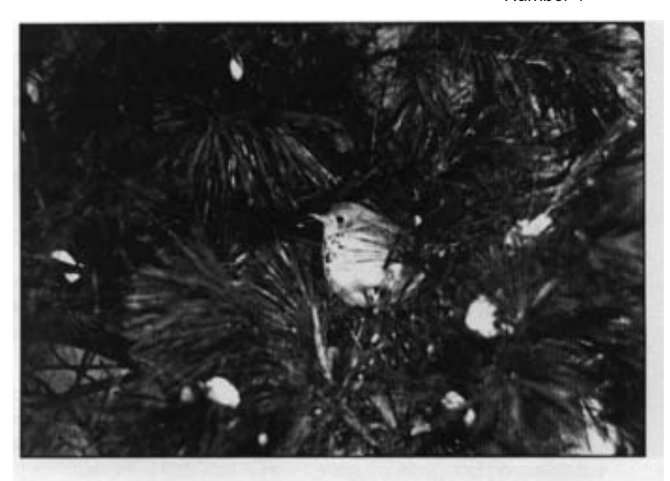
Hermit Thrush (Cathanus fuscescens) - Seiberling Naturealm - 19 January 1994

Horned Larks were regularly found in their usual Lorain Co. winter haunts (NK). In Portage County, as many as 150 could be found in the manure laden fields of Shalersville Township