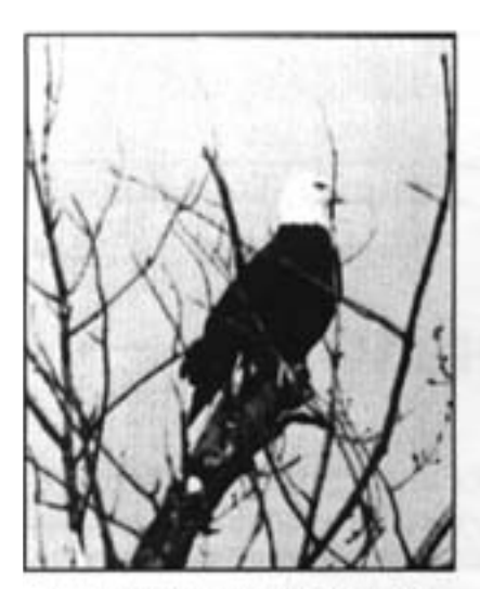
Baid Eagle (Haliaeetus leucacephalus) Lake Rockwell - 27 December 1993 by Larry Rosche