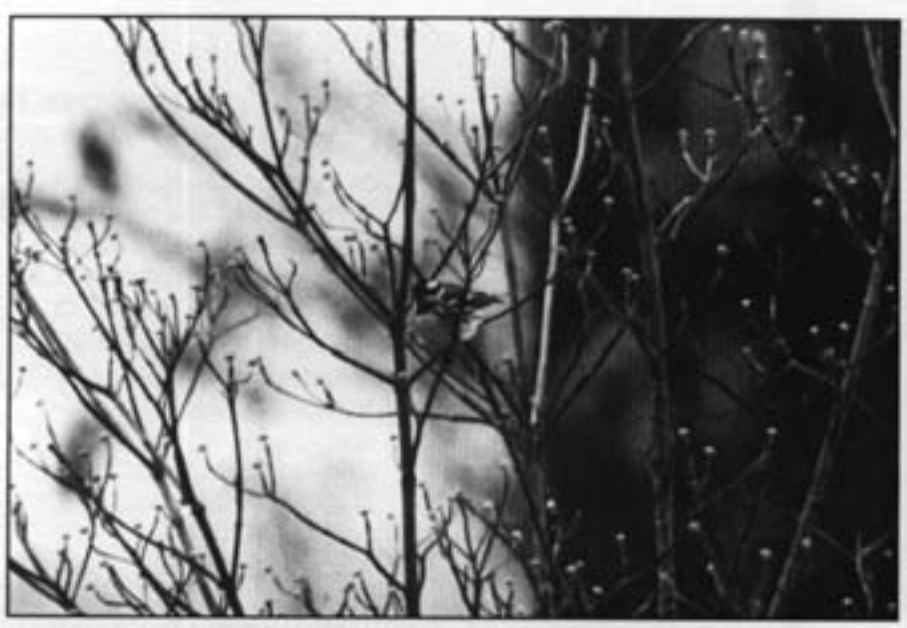
Black-throafed Gray Warbler (Dendroica nigrescens) - Independence - 19 December 1993 by Larry Rosche

The 22°F temperature at 8:00 a.m. on December 13th seemed to increase the birds' feeder visits to 10- 15 minute