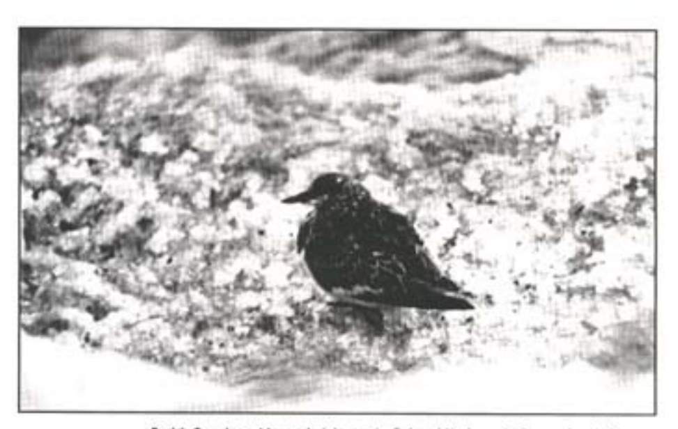
Ruddy Turnstone (Arenaria Interpres) - Fairport Harbor - 26 December 1993

MERLIN - As has become the expected several wintering birds were found. The most astonishing of the reports was the 4 that frequented a Bath