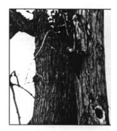
Plieated Woodpecker (Dryocopus pileatu Lakewood - 20 February 15