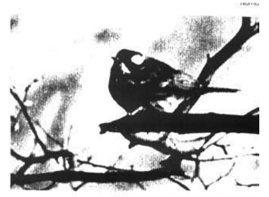
Black-throated Gray Warbler - 27 April 1992 - Baldwin Lake by Frank Greenland

Scarlet Tanagers were in expected totals. A count of 40 Northern Cardinals at Lake Isaac provoked thoughts of migratory movement by the species from Harlan. Rosebreasted Grosbeaks were common throughout the region after 1 May. Sparrow migration was generally, thought to be low in numbers by the majority of birders. Pogacnik's banding data do not support these impressions. No massive mixed flocks were noted at traditional staging areas such as HBSP and Gordon Park by our regular reporters. An American Tree Sparrow was tardy at the Carlisle Visitor Center on 27 Apr. (NK). Vesper Sparrows were early at Girdled Road Park on 8 Apr. (JP). Two were in Streetsboro on 12 Apr. (CH). The first Grasshopper Sparrows were in Hogback Ridge Park on 22 Apr. (JP). They were reported to be on territory in Shalersville on 31 May (LR). Fox Sparrows visited many feeders in the early part of the season. John Augustine noted that it was a very good year for them in Geauga Co. They departed northward in early April and few were seen along the lake. Lincoln's, White-throated, and White-crowned Sparrows were far below normal numbers. Dark-eyed Juncos numbers were rather disappointing as they moved through the region. This was unexpected because they had wintered in the region in good numbers. Many Bobolinks