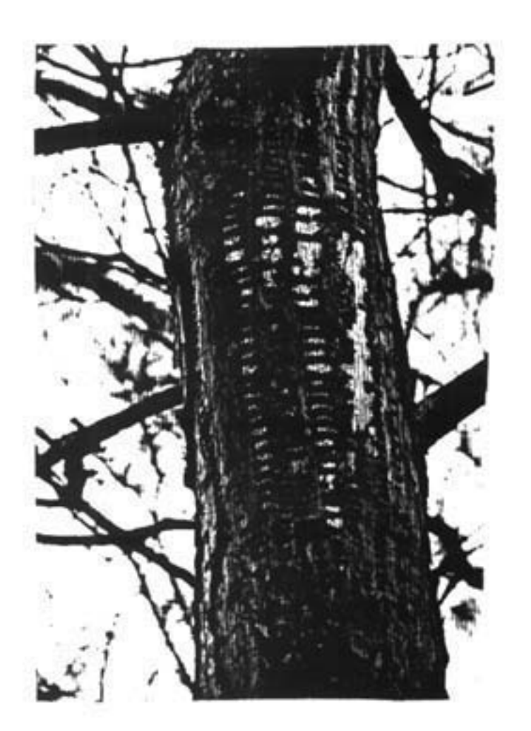
Yellow-bellied Sapsucker handiwork - 8 April 1992 - Cleveland Heights