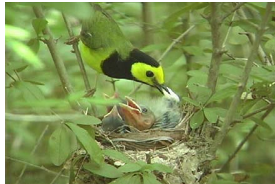
Hooded Warbler at nest, photo by Miles Reed.

If you have summer birding checklists, you have valuable Atlas data. Attend a Data Get Together and we'll enter your sightings into the online data base.